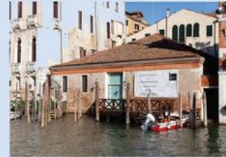
7. Fondaco Marcello 2005 Hong Kong