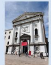
15. Chiesa della Pietà 2005 | Morocco Pavilion