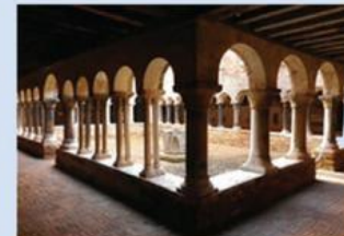
14. Schola S. Apollonia 2001 | 1st participation of Singapore 1st participation of Hong Kong