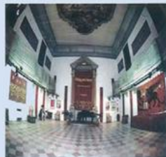
5. Ex Oratorio S. Filippo Neri 2001 Jamaica Pavilion