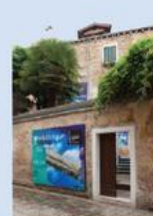
21. Arsenale (Campo della Tana) 2008 Next Gene 70