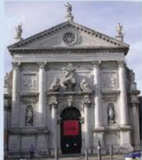
2. Chiesa di San Stae 1999 August Rodin