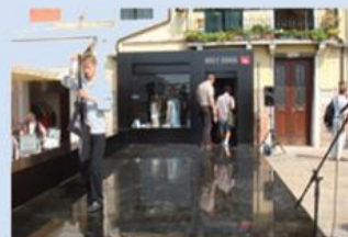
20. Riva San Biagio | 2005 U.S. Virgin Islands