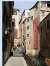
12. Palazzo Palumbo Fossati 2007 Lee Ufan