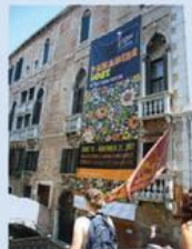
4. Palazzo Pisani 2007 Roma Pavilion