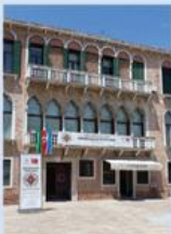
9. Palazzo Lezze 2013 Azerbaijan Pavilion