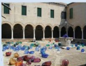
18. Chiostro S. Francesco della Vigna