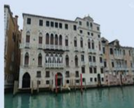
10. Palazzo Barbaro 2015