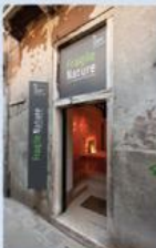
3. Spazio Ferrari 2009 Latvia