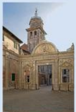
1. Scuola Grande di San Giovanni Evangelista 1984 Quartetto