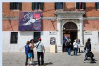
19. Caserma Cornoldi | 2009 1st participation Principality of Monaco