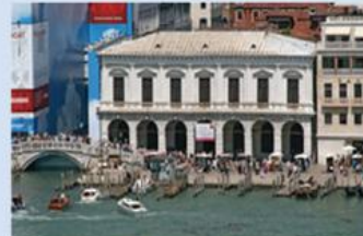
13. Palazzo delle Prigioni 1995 1st participation of Taiwan