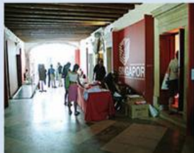
11. Fondazione Levi 2003 Singapore Pavilion