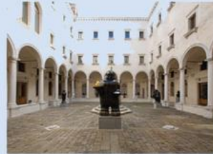
6. Cloister | telecom Italia Future Center 2005 Indonesia Pavilion