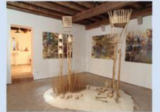
8. Palazzo Malipiero 2003 Indonesia Pavilion