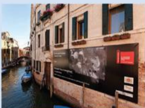
17. Spiazzi | 2009 Georgia Pavilion