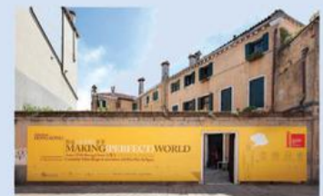
22. Arsenale (Campo della Tana) 2003 Hong Kong